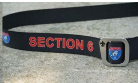
WEB BELT $25