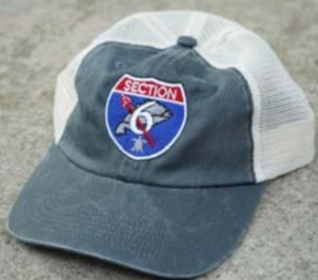
MESH BACK CAP $25