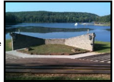
Amphitheater and Lake at Camp Crooked Creek

weekend as a team, and we are ready to provide a great Conclave!